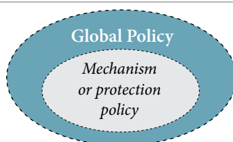
FIGURA 1: MECHANISM AND GLOBAL POLICY

Existing protection mechanisms for at-risk HRDs should be just one, albeit an important, component of a broader and more integral focus that should characterise public policies on the right to defend human rights.