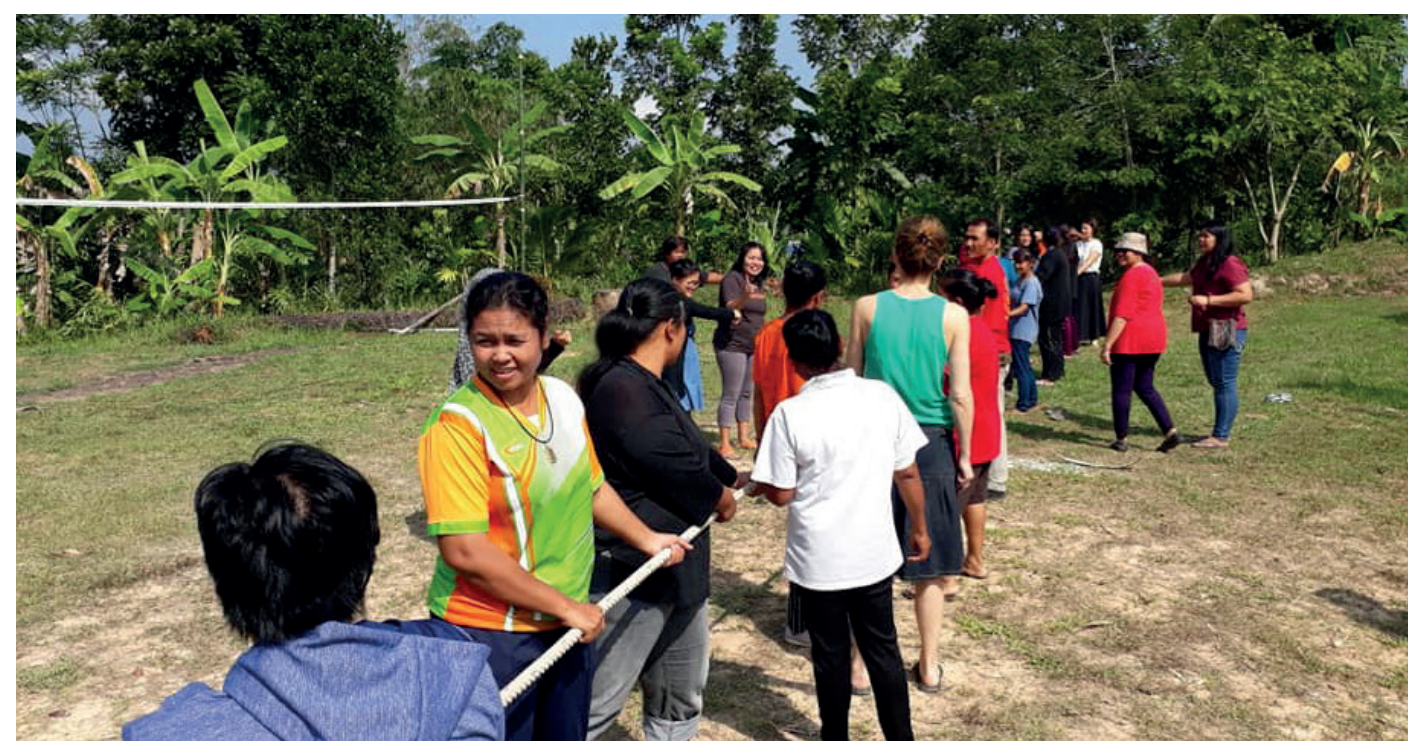
Indonesian and Thai human rights defenders participate at a workshop on protection strategies during the community exchange organised by Protection International in December 2018, in Southern Thailand.

of judicial bodies to prosecute cases brought by NHRIs traps their work in a capacity that is strictly investigatory and ultimately advisory. However, this factor reinforces the importance of mandate interpretation and the complementary role of civil society mobilisation. As Commissioner Siti Noor Laila noted: